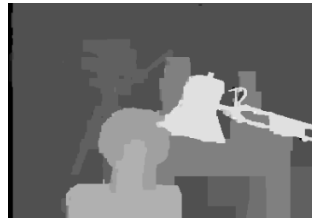
Computed Depth Map